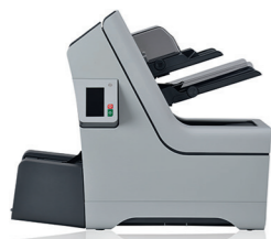
1 document feeder