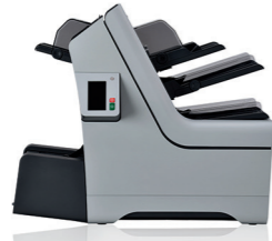
2 document feeders + Inserts feeder