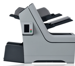
1 document feeder + Inserts feeder