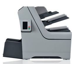
2 document feeders